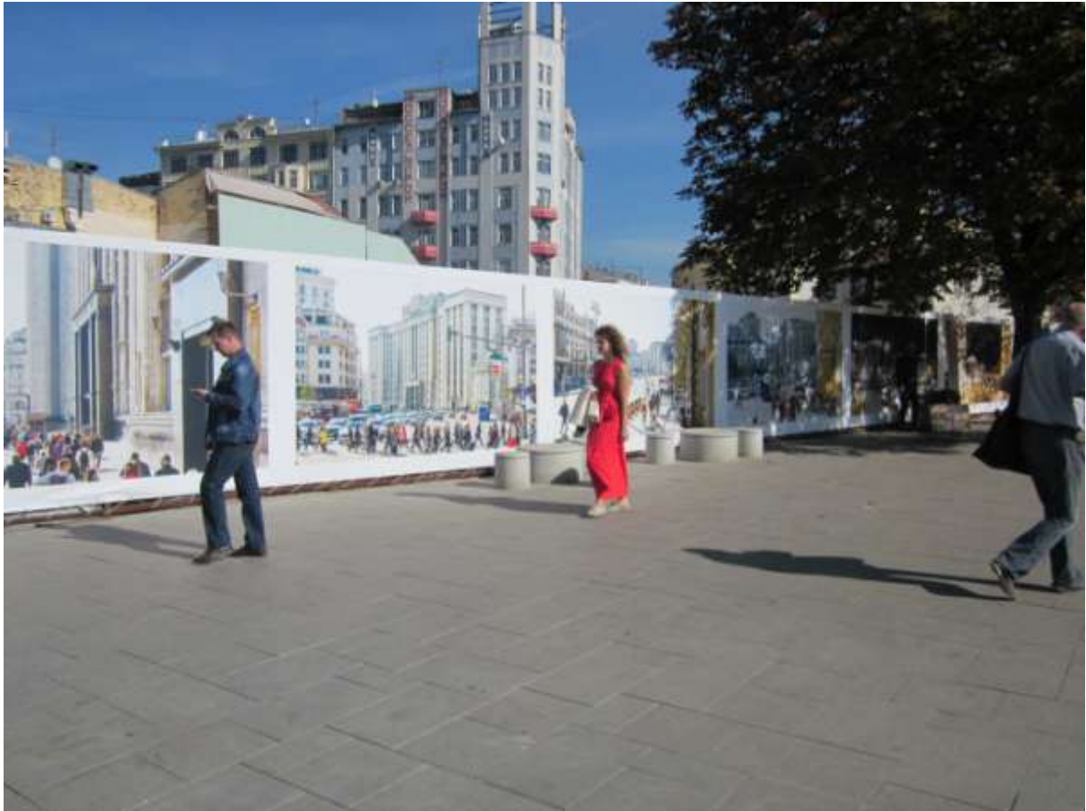
A street near our hotel in Moscow.