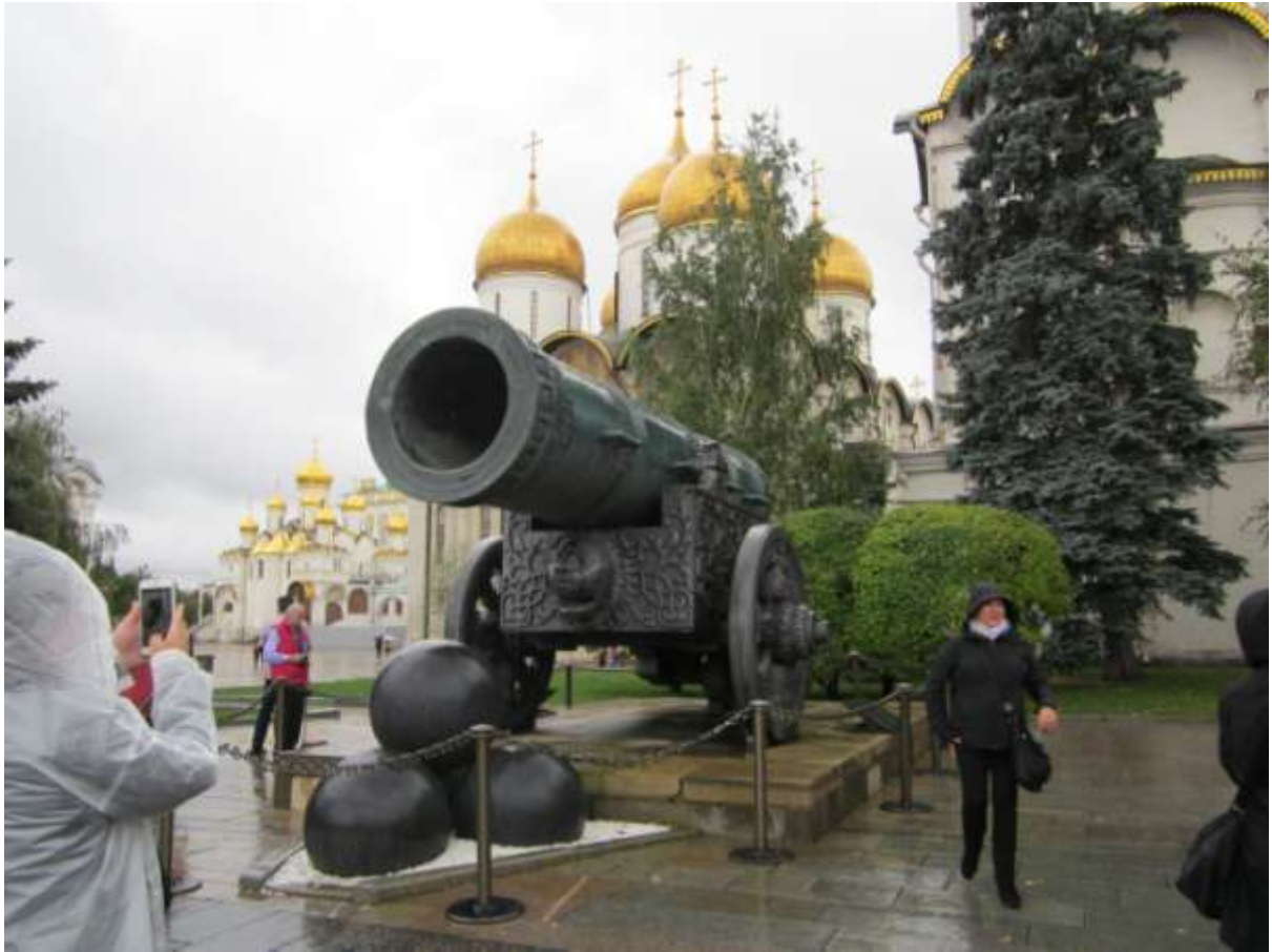
The largest gun.