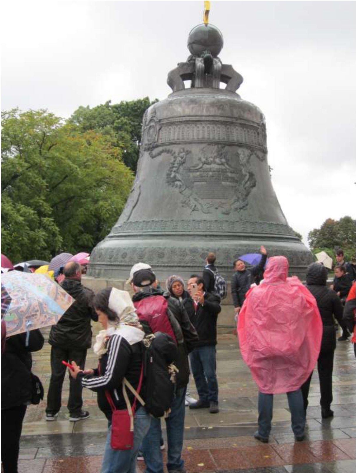
The largest bell but never rung. Was on a wooden stand which caught fire and the bell fell and broke.